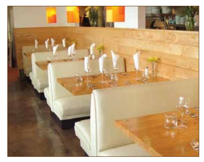
Clean, modern design meets the enduring warmth and timelessness of wood.