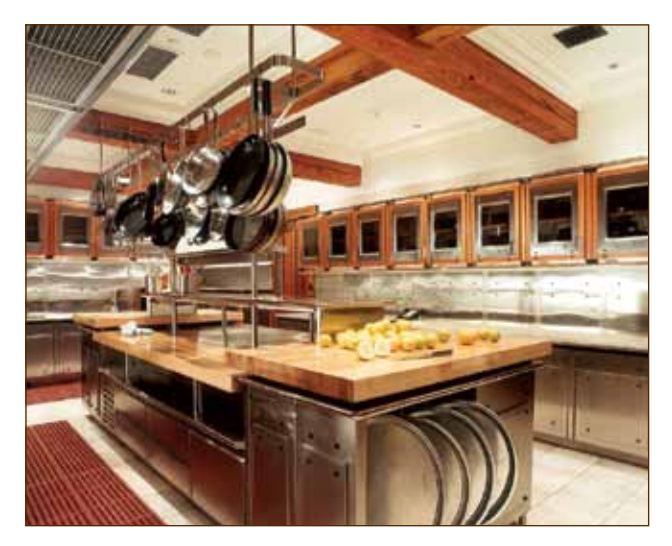
A center prep island outfitted completely in butcher block offers the best combination of functionality and flexibility.